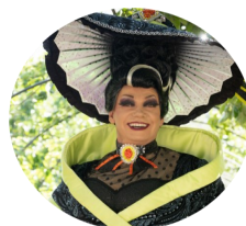
Wicked Stepmother Craig Revel Horwood